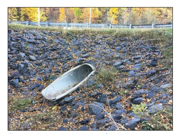
Figure 11 A drainage pipe under US 1.

The Reason Foundation, a nonpartisan public policy research group, found in 2018 that "Maine declined 21 positions from 4th to 25th in the