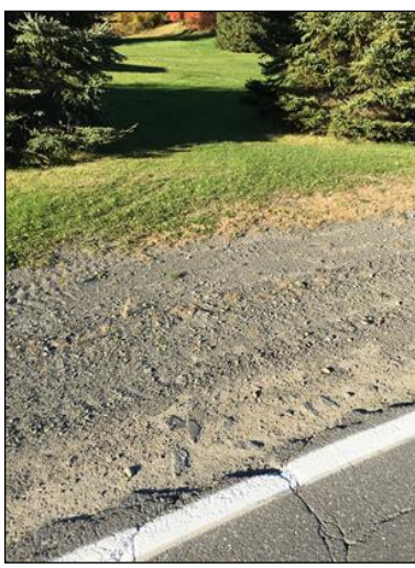
Figure 4 (left) Road surface cracking and breaking apart near edge, creating instability for vehicles, bicycles, and pedestrians using shoulder. (Right) Gravel shoulder compromised by erosion, wash boarding, and pavement cracking.

for modernizing two of the final four sections of US 1 in Maine that require reconstruction—two separate short sections of roadway located two and a half miles apart: one immediately east and one west of the town of Frenchville. (The two other sections are in eastern Maine and will be completed around the same time as these two sections with other funding sources.) For this