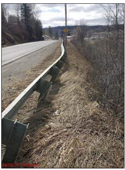
Figure 5 Compromised guardrail high above a steep slope along the road.

Plans include constructing paved shoulders between 4–6 feet wide throughout the Project, which means laying approximately 230,000 square feet of pavement to areas where gravel shoulders currently exist. Additional safety improvements include adding more than 3,700 feet of new guardrail and upgrading an additional 7,000 feet of existing guardrail to protect vehicles from the steep embankment towards the railroad tracks (in some places) and the Saint John River below. Given the region's harsh winters, drainage systems are critical to drawing rainwater and melting roadplowed snow away from the road. Drainage improvements include replacing 42 culverts and adding approximately 6,000 feet of closed drainage to freely drain the roadway base and ensure longevity of the pavement. The highway will have some open drainage sections, pipes, and box culverts. Nine box culverts will house streams with two of those requiring fish passage. The proper size of all 9 culverts has been determined