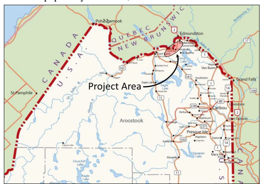
Figure 1 Map of northern Maine.

interstate highway and few roads traverse the vast forestland covering much of the topography. US 1 is as significant to northern Maine today as it was when first constructed in the 1930s and '40s. Since that time, various sections have seen periodic improvements. Over the past 25 years, piece by piece, most of US 1 in Aroostook County underwent full reconstruction, but a few sections have not. The section reaching all the way up eastern Maine to Madawaska near the northern tip has been mostly