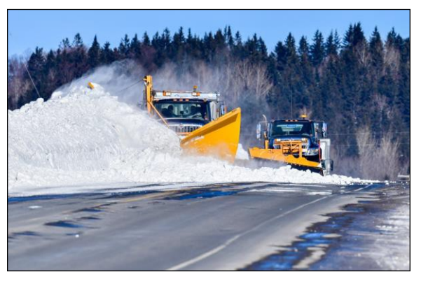
Figure 8 The amount of snowfall in northern Maine requires frequent use of snowplows and road salt.

When planning infrastructure improvements in a state that sees between 50 and 90 inches or more of average annual snowfall between the southern parts of the state and the northern parts of the state, respectively, MaineDOT has always thoroughly considered the impact a changing climate has on mobility. MaineDOT's Climate Initiative is laid out on their website at <a href="https://www.maine.gov/mdot/climate/">https://www.maine.gov/mdot/climate/</a>. MaineDOT is a key partner in the Maine Climate Council . MaineDOT also realizes