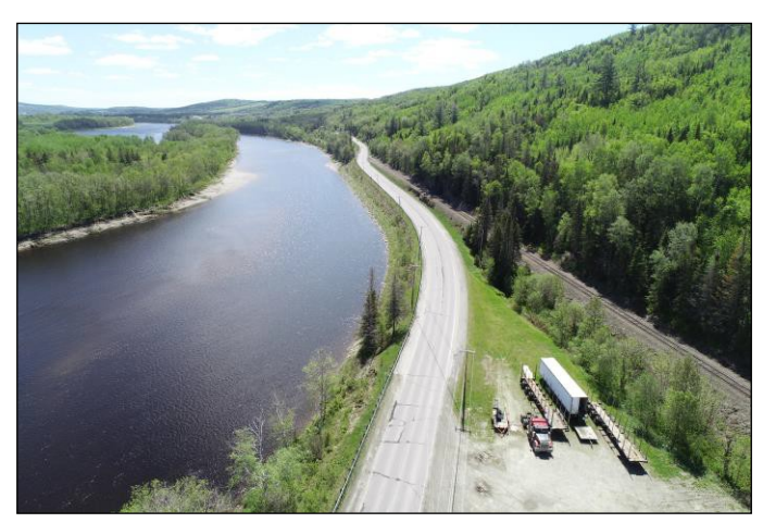
Figure 2 US 1 west of Frenchville.

The highway is also a 2021 U.S. Bicycle Route (USBR 501) designee, stretching from Bangor, Maine along the Saint John River to Allagash, 27 miles southwest of Fort Kent. The 327-mile