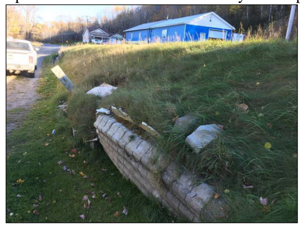
Figure 7 A section of retaining wall holding up an embankment below the road surface is compromised and threatening a private driveway below.

If a RAISE grant is not awarded and the Project is not completed as described, this portion of US 1 will continue to exist as the weak link in the chain that is northern Maine's primary road. While repairs will be made from time-to-time, important components of the road such as the culverts that allow for fish passage will not be as effective as they could be today and may be threatened with collapse in the future. As pipes and culverts eventually fail, they will be replaced. That failure will most likely occur sporadically, meaning exhaustive repairs would be