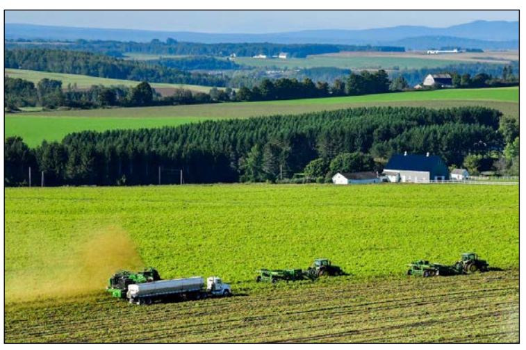
Figure 10 Potato farming in the region.

Highways are the nation's primary means of rapidly moving goods and people far distances in a cost-effective manner. Highways help connect families and communities, deliver medical supplies, and keep store shelves stocked. An efficient transportation network helps keep prices low and product availability high. Long periods of challenging weather make roads even more crucial to connecting goods and services and the people who need them. In northern Maine, there is but one primary highway—US 1—and