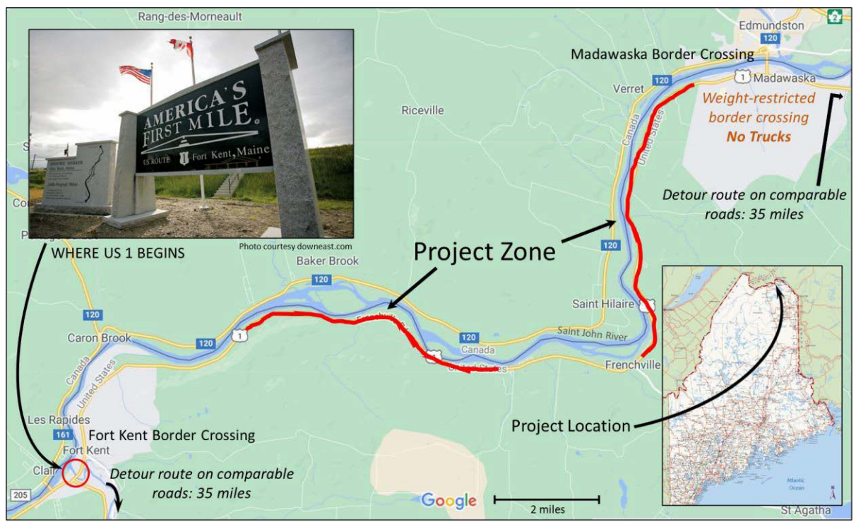
Figure 3 Map of Project area.

It can be challenging to connect with family via poor roads. For generations, Acadians (descendants of the French who settled in what is today Eastern Canada's Maritime provinces and northern Maine) and Mainers have viewed the Saint John Valley not as part U.S. and part